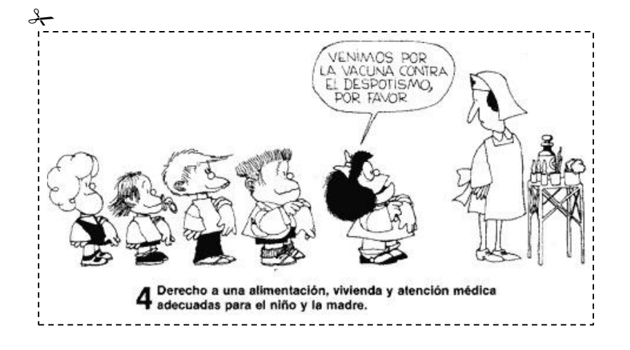
MAFALDA—We come for the vaccine against despotism, please.

4. Right to good food, housing and medical services for the child and the mother.