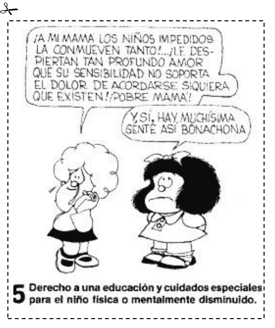
SUSANITA—Disabled children move my mom so much! ... They arouse such a deep love inside her that her sensibility does not stand the pain of even remembering that they exist! Poor mom!

4. Right to good food, housing and medical services for the child and the mother.